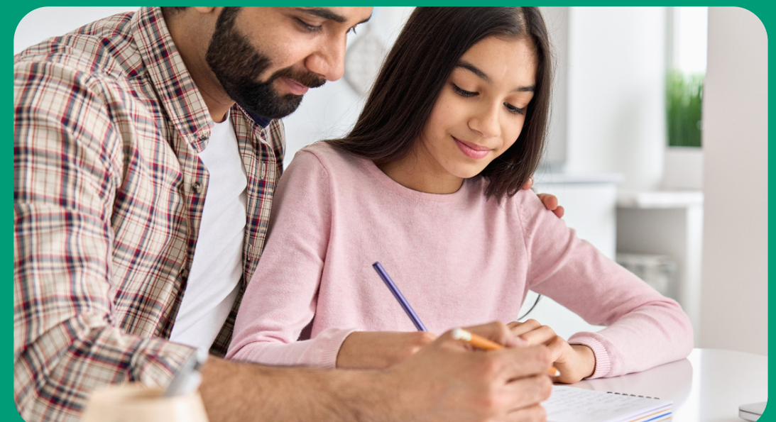
Building Strong Relationships